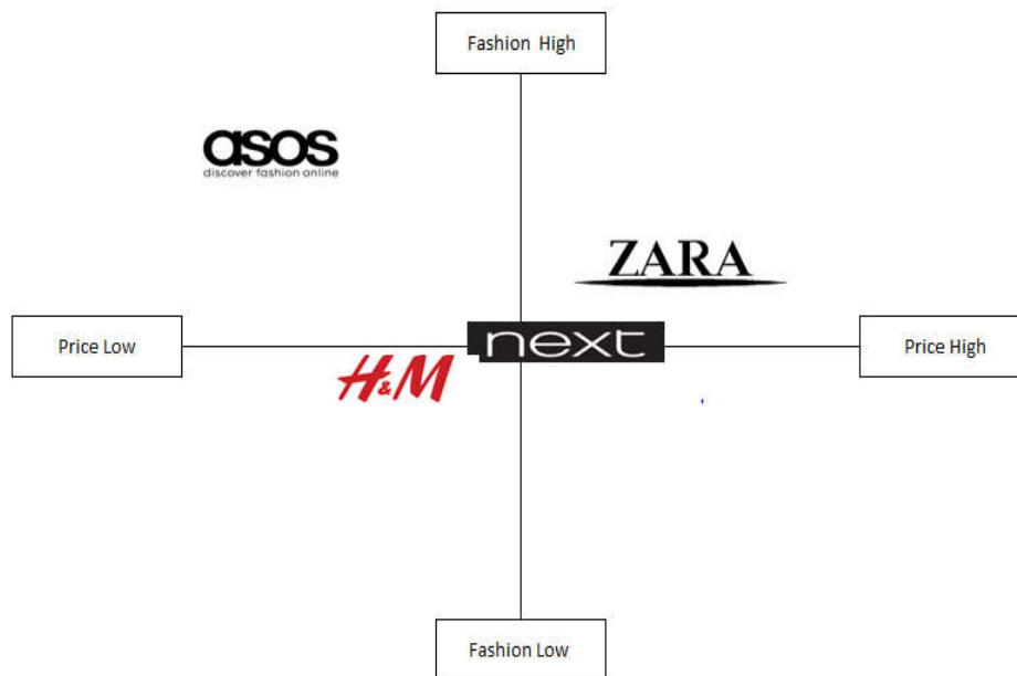
Figure 1: Current Perceptual Map of NEXT plc

marketing positioning strategy for their offerings. The positioning map is based on the perception of the consumers that is why it is also called positioning map. The positioning map helps company in identifying where they are positioned presently and where the company wants to be positioned in the future (Lee, Yang, Chen, Wang, and Sun, 2015). The positioning map of NEXT is shown in the below figure with reference to the company current competitors.