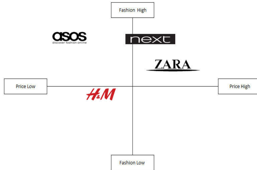
Figure 2: Planned Perceptual Map of NEXT Plc